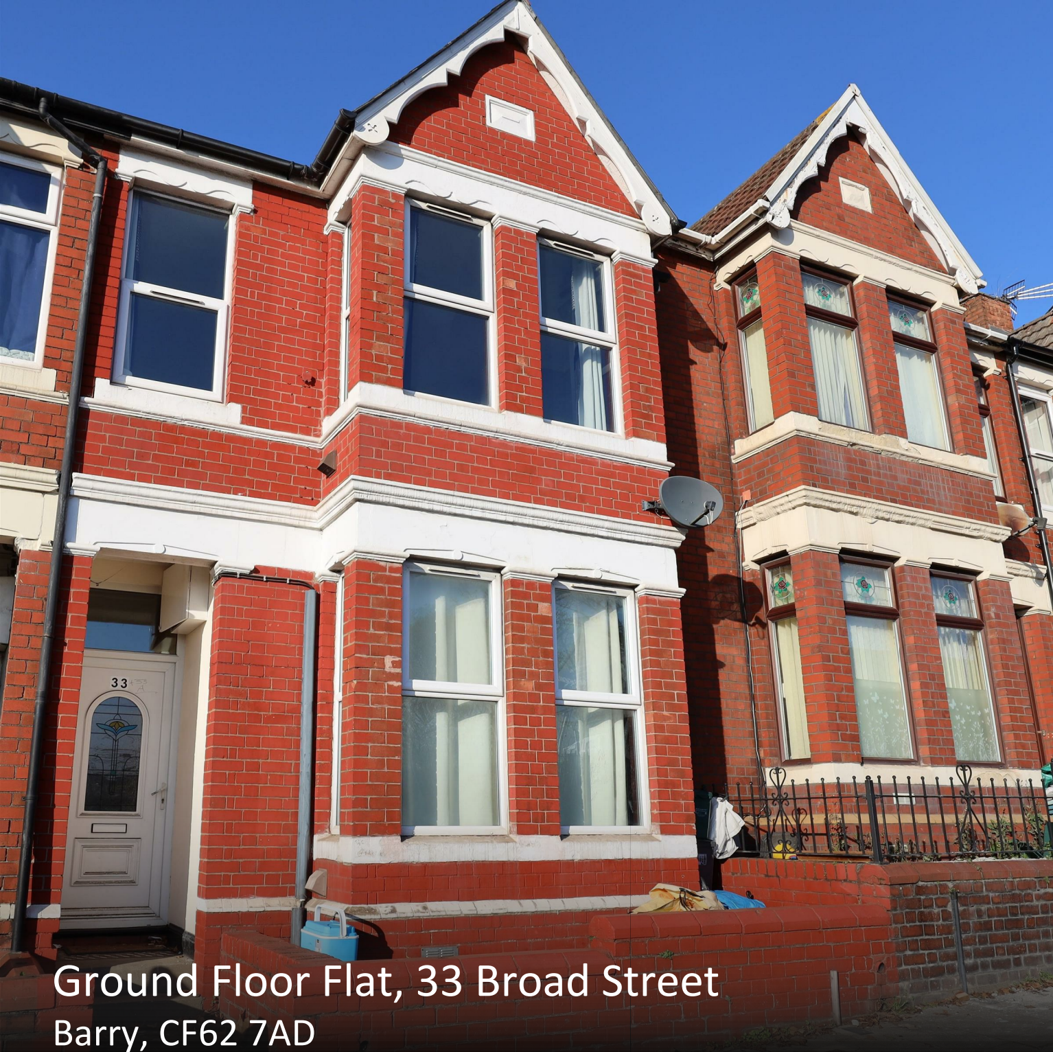
Ground Floor Flat, 33 Broad Street Barry, CF62 7AD